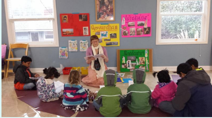
Sunday school - Madhava class (4-6 years old kids)