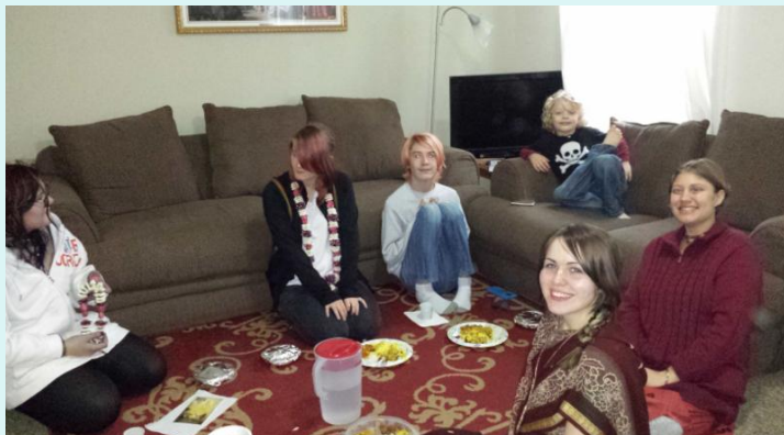
Krishna lounge for newcomers