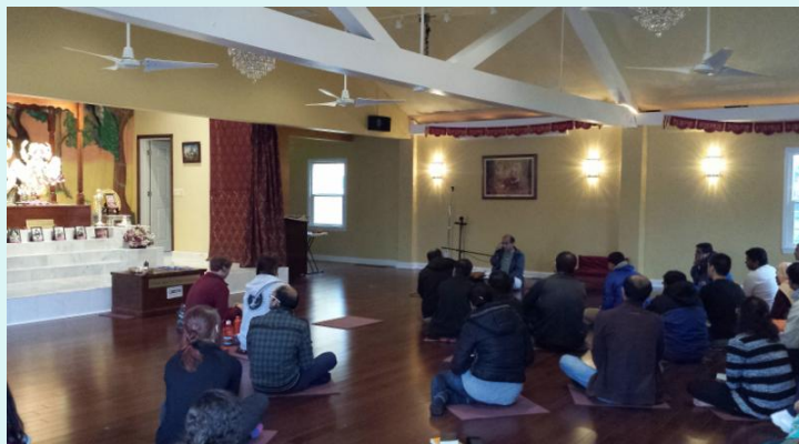
Bhagavad Gita class