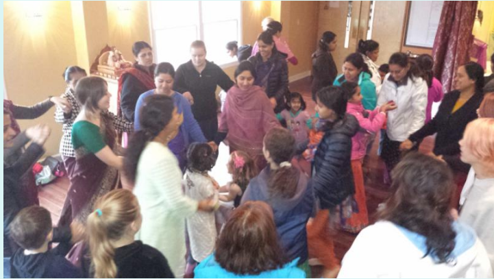
Dancing during aarti time